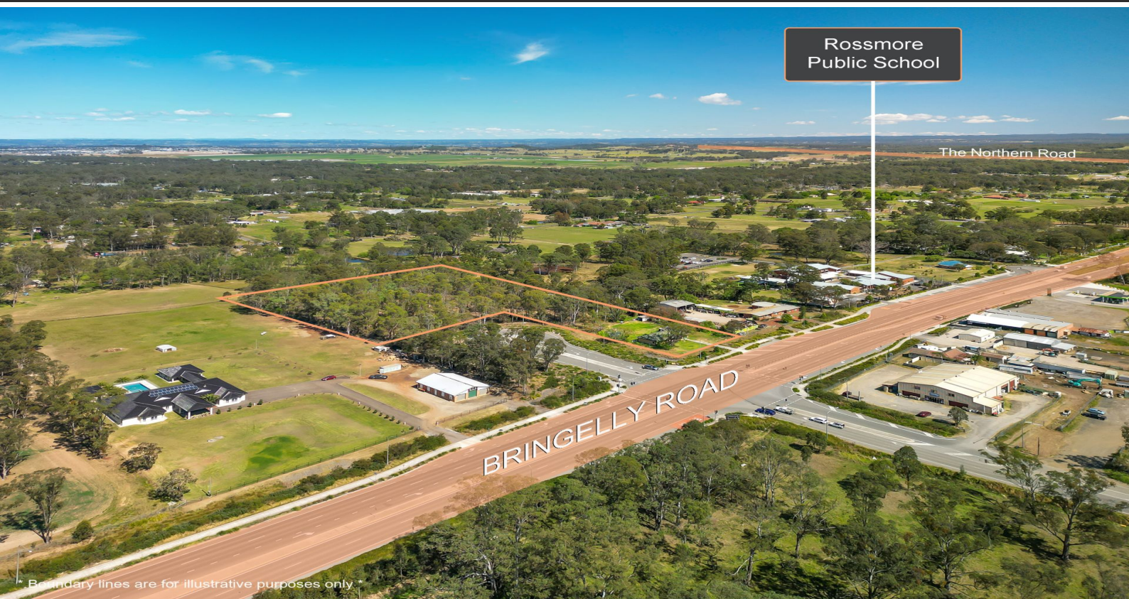
Boundary lines are for illustrative purposes only